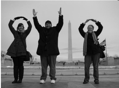
Theater students (and the Washington Monument) in D.C. for the regional Kennedy Center American College Theatre Festival.

The Theatre Program at Ohio State Mansfield is a division of the Department of Theatre, Film, and Media Arts on the Columbus Campus. Here students can start work toward a Bachelor of Arts in Theatre, or they can complete a minor in theatre while pursuing another major field. We offer an Introduction to Theatre course as well as courses in acting, directing, technical theatre, and multicultural theatre. We produce three main stage shows each year and a number of student-directed projects. Anyone from the campus or the local community is welcome to audition for all shows or participate backstage. Students can receive course credit for participation in these shows as well as other production-based projects in the department.