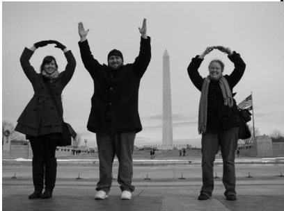
Theater students (and the Washington Monument) in D.C. for the regional Kennedy Center American College Theatre Festival.

The Theatre Program at Ohio State Mansfield is a division of the Department of Theatre, Film, and Media Arts on the Columbus Campus. Here students can start work toward a Bachelor of Arts in Theatre, or they can complete a minor in theatre while pursuing another major field. We offer an Introduction to Theatre course as well as courses in acting, directing, technical theatre, and multicultural theatre. We produce three main stage shows each year and a number of student-directed projects. Anyone from the campus or the local community is welcome to audition for all shows or participate backstage. Students can receive course credit for