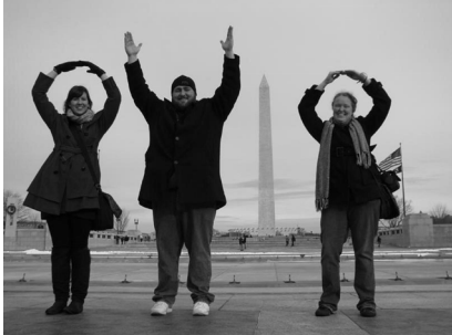
Theater students (and the Washington Monument) in D.C. for the regional Kennedy Center American College Theatre Festival.

The Theatre Program at Ohio State Mansfield is a division of the Department of Theatre, Film, and Media Arts on the Columbus Campus. Here students can start work toward a Bachelor of Arts in Theatre, or they can complete a minor in theatre while pursuing another major field. We offer an Introduction to Theatre course as well as courses in acting, directing, technical theatre, and multicultural theatre. We produce three main stage shows each year and a number of student-directed projects. Anyone from the campus or the local community is welcome to audition for all shows or participate backstage. Students can receive course credit for